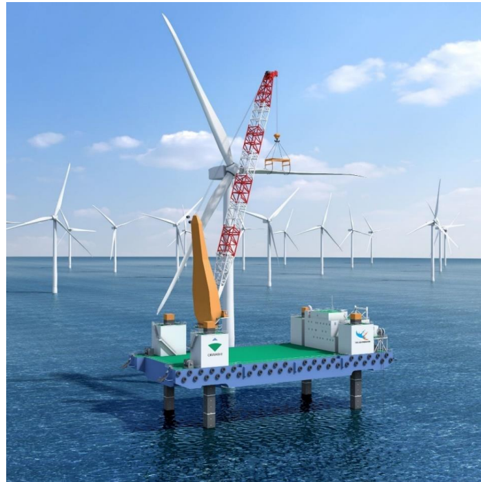
Project 05 SEP (Self Elevating Platform) Image