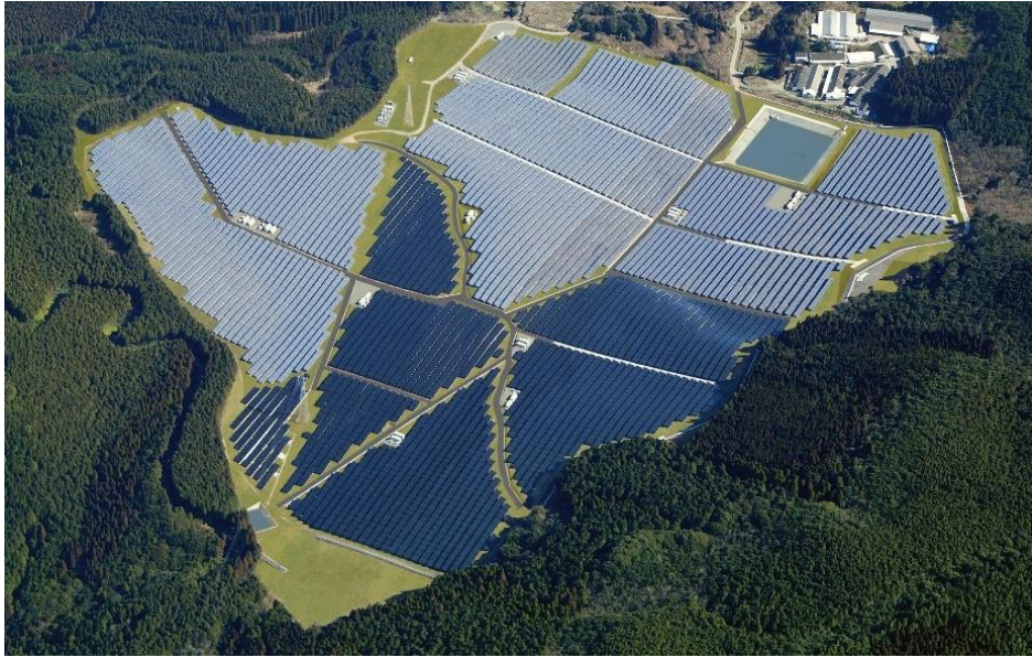
Project 01 Ashikita Solar Power Station, Solar PV

DNV reviewed the eligibility of the nominated projects and assets to meet the criteria for the project categories above.