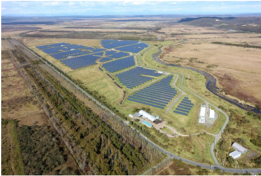
Project 02 Kushirocho Toritouchigenya Solar Power Station, Solar PV