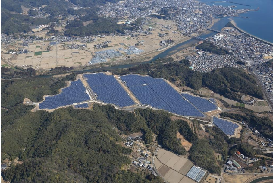
Project 03 Hyugahichiya Solar Power Station, Solar PV