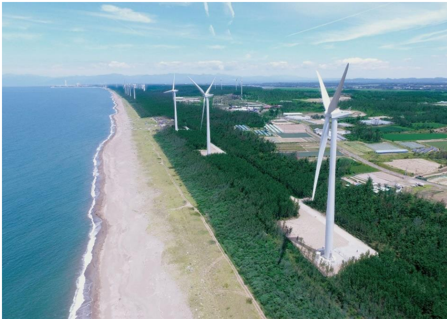
Project 04 Mitanehamada Wind Power Station